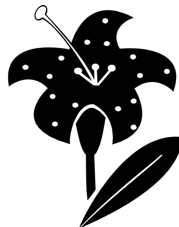
Class Flower: Lily

Class song: It's Time by Imagine Dragons