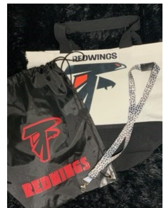
St. John totebag