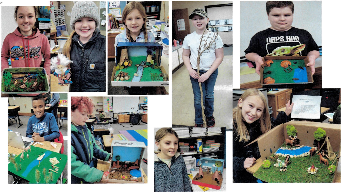
5th grade celebrating Native Americans. Fabulous Job!